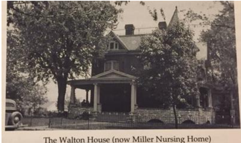
The Walton House (now Miller Nursing Home)